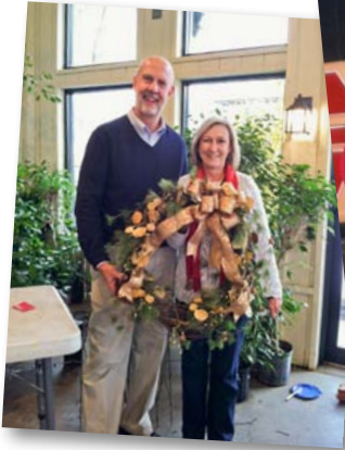
Kearney Floral Visit