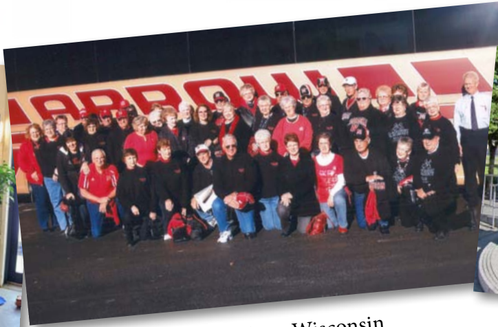
Nebraska v. Wisconsin Football Game Trip