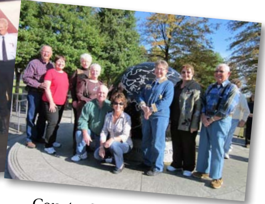
Country Music Awards Trip